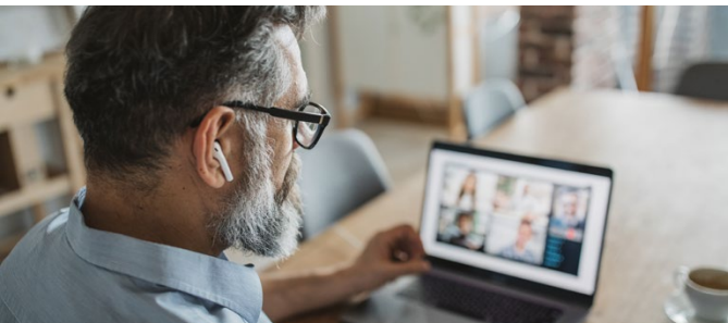
Data compiled from customer survey sent in April 2020